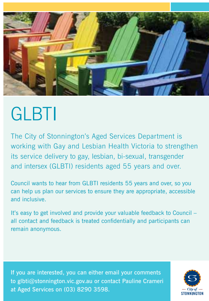
Figure One: flyer for GLBTI consultation

A brief GLBTI survey has been developed for any people contacting us as a result of the flyer. To date four clients and one community member have responded to the invitation. All have agreed to participate in a further communication and/or discussion group.