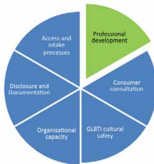
Figure One: Relationship between professional development and GLBTI-inclusive practice

Feedback on the audit tool developed by GLHV showed that the tool was simple to use and guided organisations on how to develop an action plan for improvements. In response to the audit, GLHV experienced an increase in the number of organisations seeking support to work through the practical steps required to implement their action plan. To meet this need GLHV developed the training program: How 2 create a GLBTI-inclusive service.