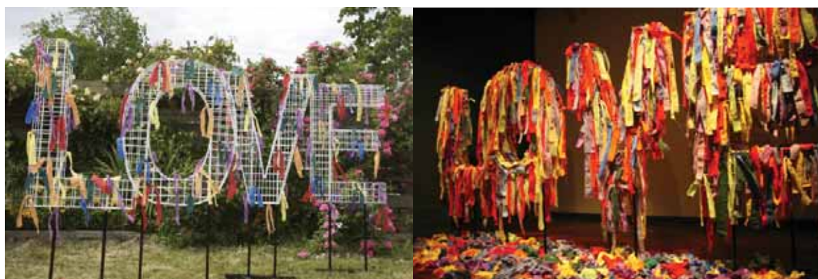
Figure One and Two: love sculpture with messages of support for the GLBTI community

As the sculpture toured local communities and galleries we advertised for expression of interest in a local GLBTI consultative group. We also gave these flyers to staff for themselves, friends, family and clients and advertised in local media. The project coordinator also gave a number of radio interviews on the mental health and wellbeing issues for our GLBTI community. Slowly we started to receive calls from GLBTI people. Each individual had a story to tell and wanted to be active in making change in the community but had real concerns of safety, confidentiality and anonymity. To address this we began the process by meeting with members of the group individually. When the group was ready to meet as a collective we developed group 'rules' that outlined the importance of confidentiality. The rules were discussed at the first meeting, with the project coordinator highlighting that in a small rural town it was particularly important to protect confidentiality. The group were prepared for the likelihood that they would run into each other in the street and how important it was not to acknowledge the GLBTI consultation group in that setting. The group also discussed the importance of protecting the identity of some Trans members who were not known as Trans people in the local community.