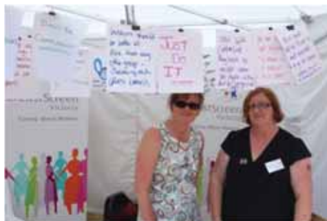
Figure Two: BSV stall at Midsumma Carnival

A common response from LBT women as they walked past and saw the stall was: Ooh! This response was discussed with one participant who reported that the stall reminded her that she needed to have a