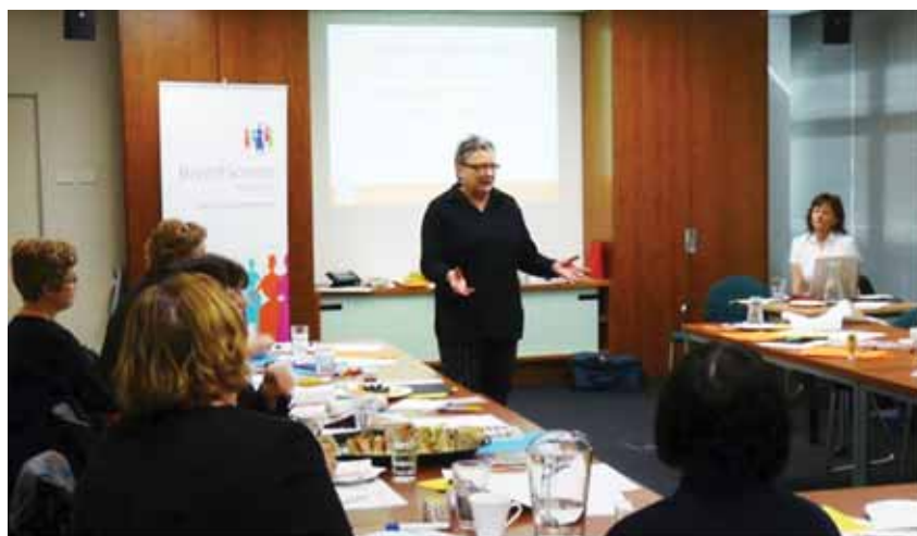
Figure One: presentation by Gay and Lesbian Health Victoria

At the time, Gay and Lesbian Health Victoria was undertaking a review of the literature on the risks of breast cancer for lesbians. The review by Banjit (2009) identified possible concentrations of risk factors among lesbians (see: www.glhv.org.au/breastcancerlitreview ). Gay and Lesbian Health Victoria developed a successful application to the Australian Lesbian Medical Association and the AIDS Council of New South Wales for a grant to work with BSV to develop services that were more inclusive of lesbian and bisexual women. The work also necessarily included transwomen. The collaboration was reported on in the Southern Star Observer in March 2010 (see http://www.starobserver.com.au/news/australia-news/victoria-news/2010/03/10/research-needed-into-lesbian-breast-cancer/35307 ).